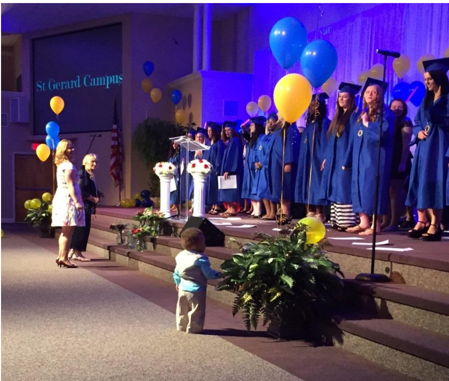
Graduation Day June 10, 2016