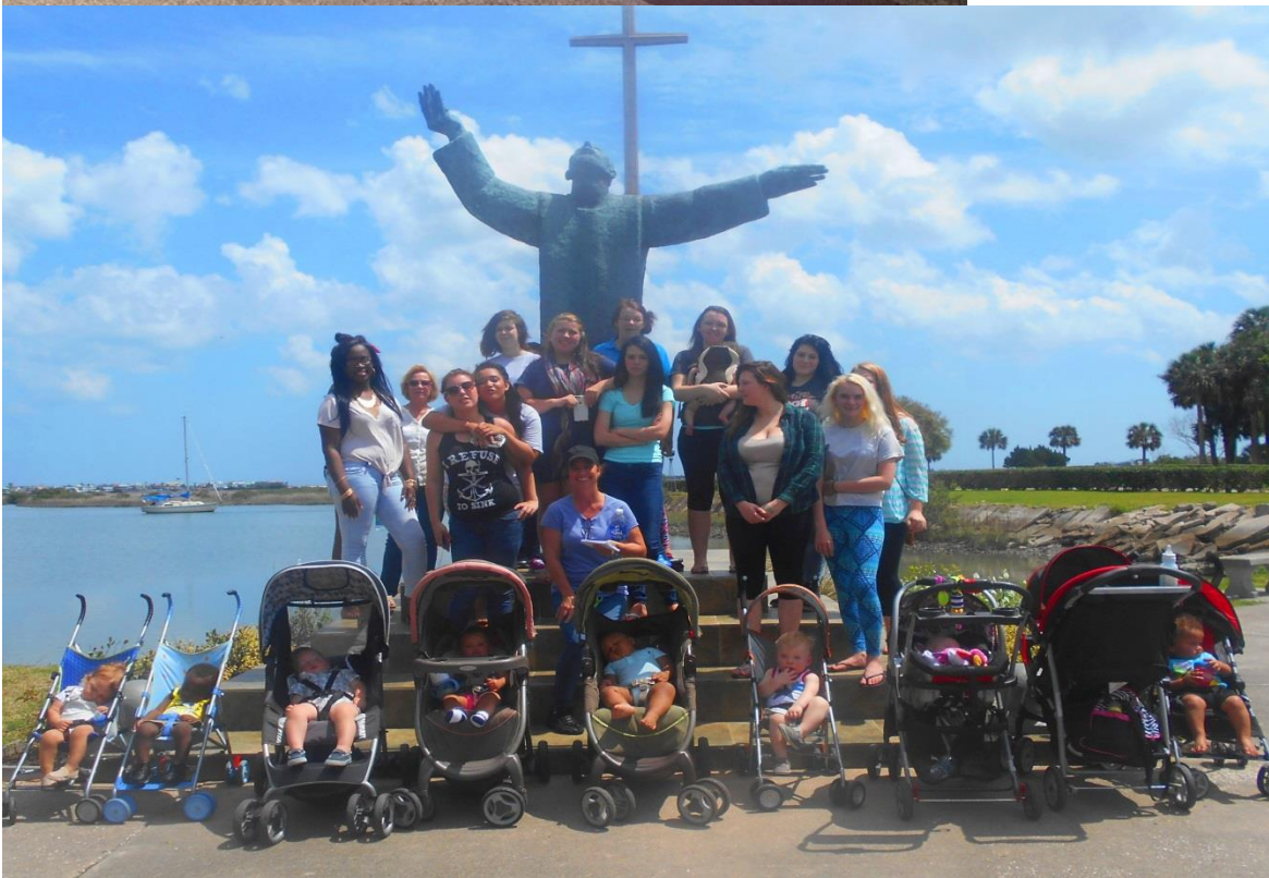
Moms and babies at the Installation of the Crosses at Our Lady of La Leche Shrine - 2/17/15

P.O. Box 4382 • St. Augustine, FL 32085 (904) 829-5516 • (904) 797-9437 • Fax (904) 825-2858 www.stgerardcampus.org